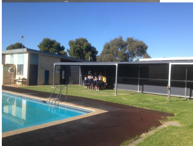
Our new shade structures.