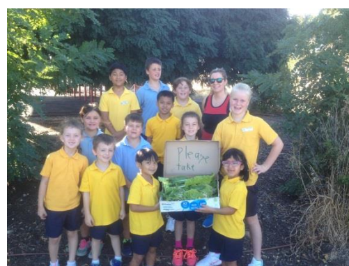
Enjoy the rest of the week!