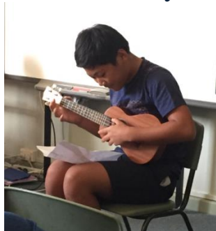
with his beautiful playing