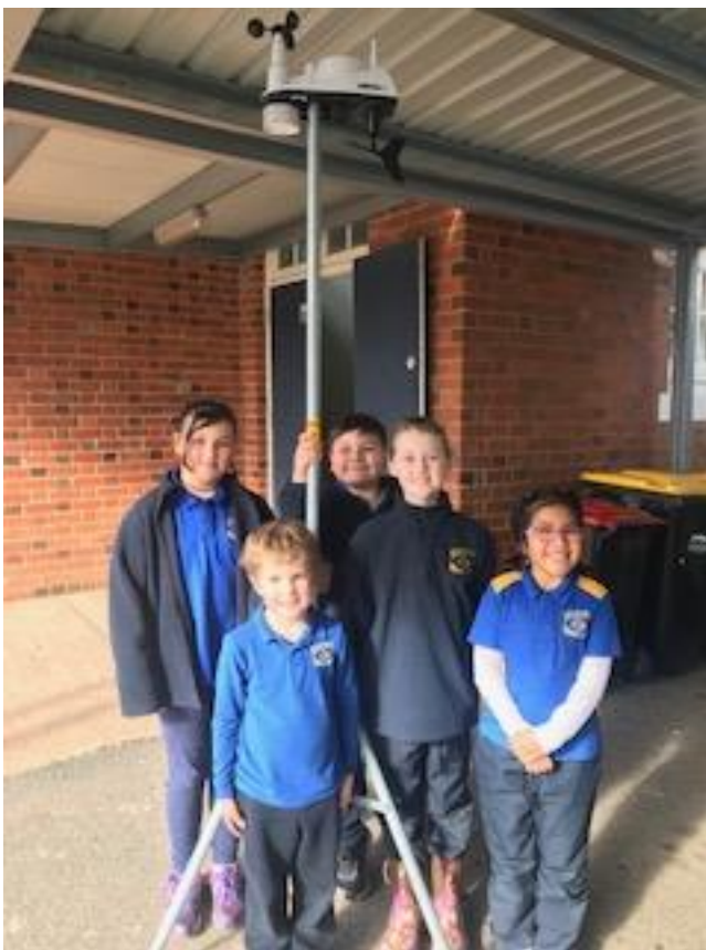
Above: A picture of our students with our new weather station