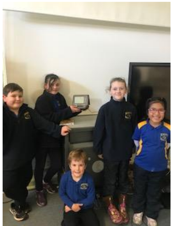
Above: We even received a whiz bang computer with our weather station so that we can see what is happening in our atmosphere.